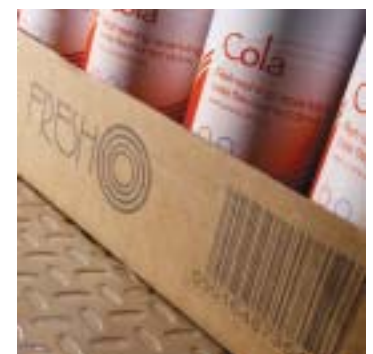
High quality text, graphics and bar codes